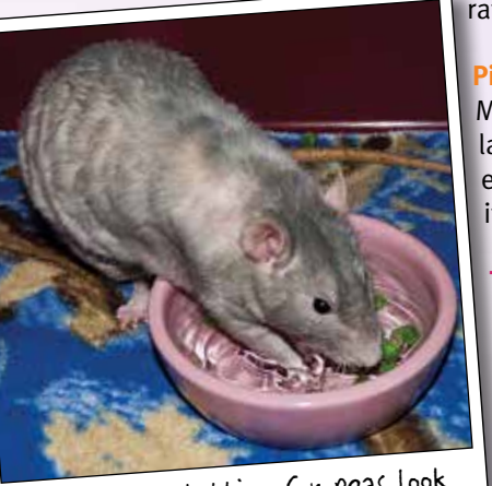
David makes bobbing for peas look easy peasy!

Rats are natural burrowers. Fill a large plastic container with plain potting soil from a garden store. Be sure to place the container on a towel – this is one messy game! Sprinkle and bury some treats around the container. Then sit back and watch your rats have a blast digging for the goodies.