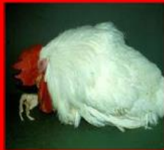
Weak, not alert