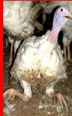
Unable to rise/ walk due to physical abnormality