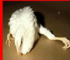
Unable to walk