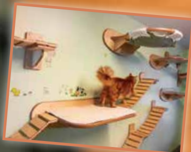
Paradise for cats! You could transform your whole home with wall and ceiling cat walkways. See examples at goldtatze.de from Germany.