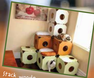
Stack wooden crates or cardboard boxes.