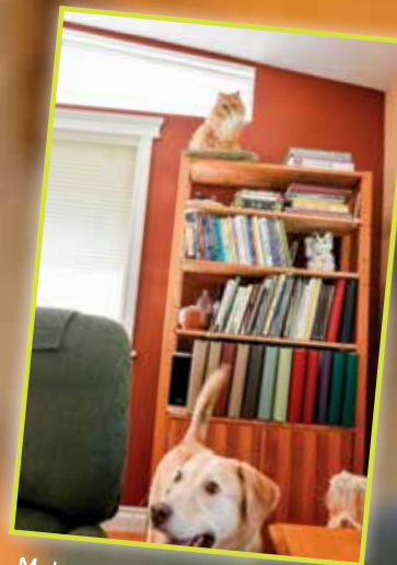
Make space on bookshelves just for your cats. Add a towel, carpet scrap or pillow for a bed.