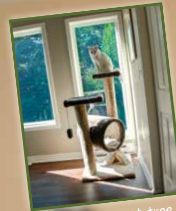
Build or buy a cat tree.

Cats like to hide sometimes. So make private nooks too, like this one from K&H Manufacturing.