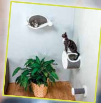
Cats like to sit up high and watch the action.