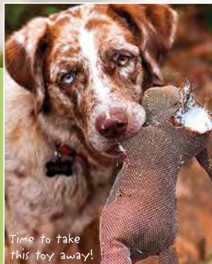
Time to take this toy away!

Pets can swallow pieces when toys fall apart, so pay attention if his toys are becoming worn. That's when it's time to throw them out and replace them!