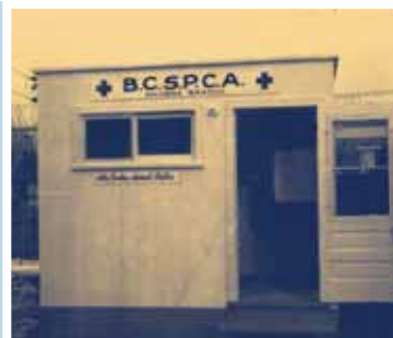
KELOWNA | 1958

The BC SPCA finds homes for nearly 15,000 animals each year through its 34 sheltering facilities and two branches that operate through foster networks.