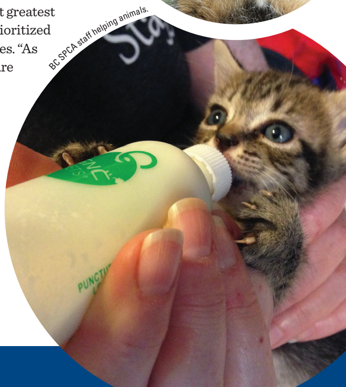
BC SPCA staff helping animals.