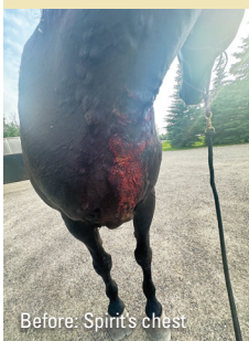
Before: Spirit's chest