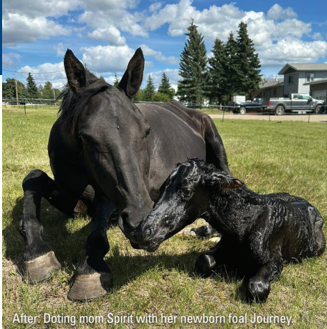
After: Doting mom Spirit with her newborn foal Journey

Eccles notes that protection officers are also seeing more complaints due to lack of access to veterinary care. “In 2024, we were able to help more than 200 animals through our diversion program, which offers assistance to guardians in need so that pets and families can stay