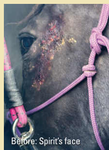
Before: Spirit's face