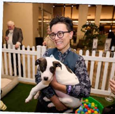
GUESTS ENJOYING THE CUDDLE LOUNGE AT THE OFFLEASHED GALA

BY PARTNERING WITH THE BC SPCA, YOUR BUSINESS BECOMES A CARING FRIEND AND ADVOCATE FOR VULNERABLE ANIMALS.