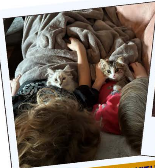
CUDDLY KITTENS WITH THEIR NEW FAMILY

Karma and her kittens were placed in the loving care of a BC SPCA foster home, where they finally had warmth, comfort, and the chance to heal. With weeks of gentle attention and expert care, the once-scared, dehydrated and hungry trio began to thrive.