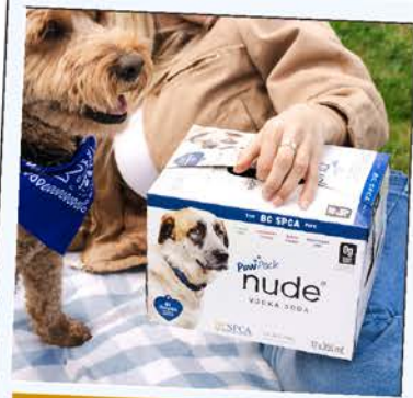
$1 FROM EVERY NUDE PAW PACK DONATED

Whether you give once or monthly, your donation provides food, shelter and medical care to animals in need. In-kind support such as products, services or auction items are also deeply appreciated. Call us at 1-800-665-1868 or donate online at spca.bc.ca/donate . Every donation saves lives.