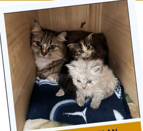
DISCOVERED IN AN ABANDONED VEHICLE

On a cold winter day, a car with flat tires was towed to a tire shop for scrapping. The vehicle's interior was filthy and abandoned, but what the staff found inside was truly shocking: a young cat and her two tiny kittens huddled together in the back seat, frightened and alone. Thankfully, the kind-hearted staff quickly brought the little family to a nearby animal hospital, who reached out to their local BC SPCA Centre. From that moment on, their lives began to change.