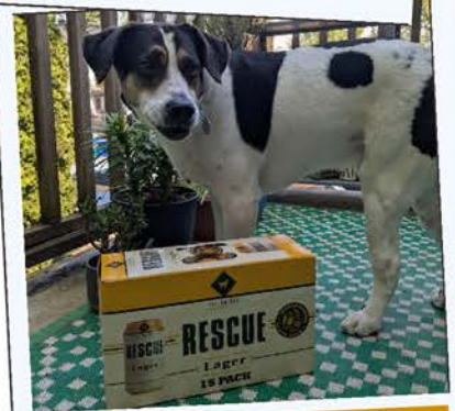
EVERY SIP SUPPORTS A TAIL WAG!