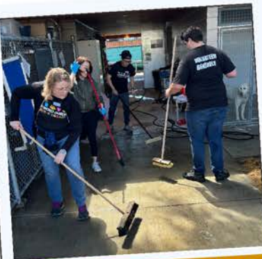
CORPORATE VOLUNTEERS HARD AT WORK