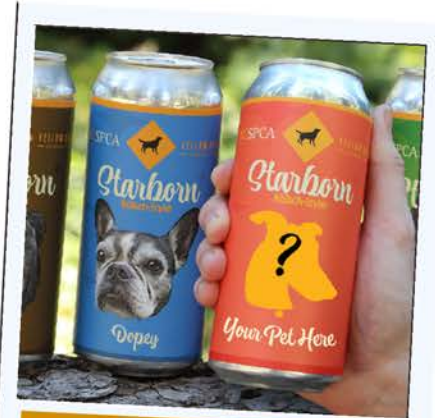
MAKE YOUR PET A YELLOW DOG BREWING STAR!