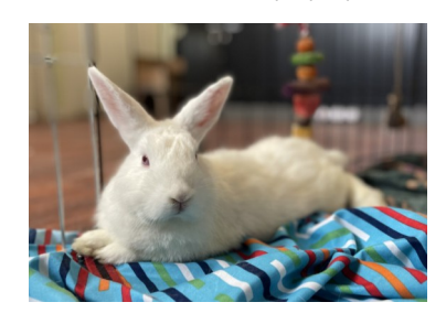
Snoop Bunnie Bun

A Heartwarming Tale of Three Bunnies Finding Their Forever Home: Lil' Hopper, Snoop Bunnie Bun, and Notorious B.U.N.