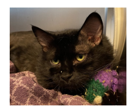
Tank happy and relaxed