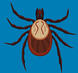
ROCKY MOUNTAIN WOOD TICK