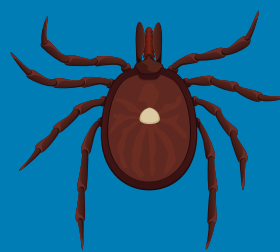
LONE STAR TICK