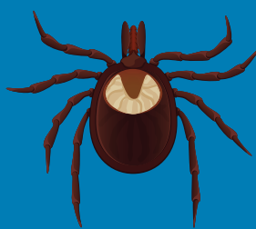
AMERICAN DOG TICK